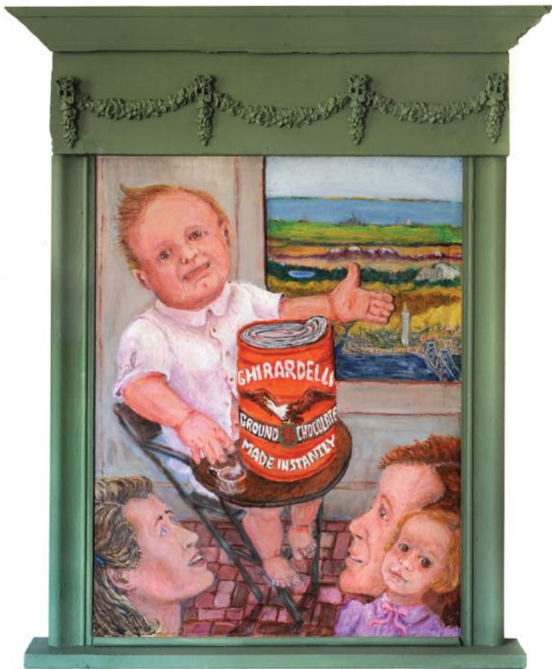
Adoration of the Chocolate Child, 2019